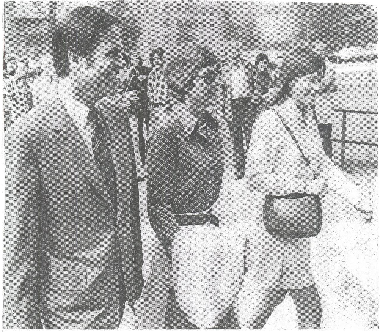
By Joe Heiberger—The Washington Post