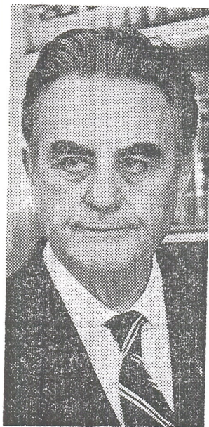
The New York Times

Inside the courtroom, a few minutes later, the five defendants greeted one another. At least a few of them are expected to try during the trial to show that the others were the responsible ones in the cover-up, but this morning, the