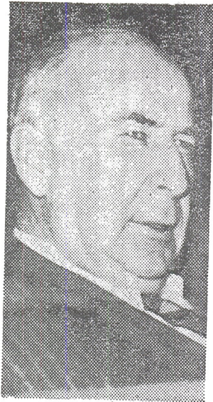
United Press International