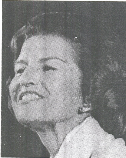
BETTY FORD AT PRESS CONFERENCE