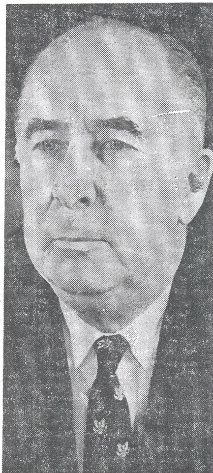
JOHN N. MITCHELL ... seeks to retain privacy