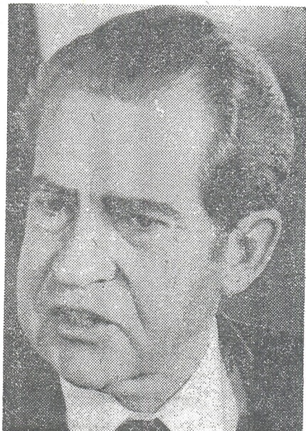
Nixon at farewell to staff.