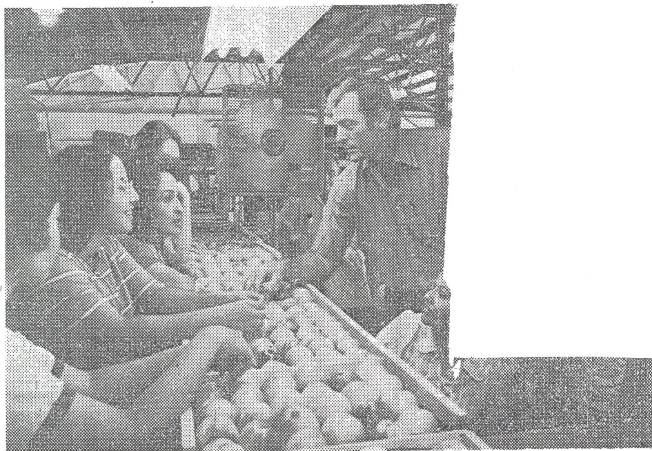
Representative Robert B. Mathias looking for votes among apple packers in Fresno County. Redistricting and Watergate aftermath are creating problems for him.