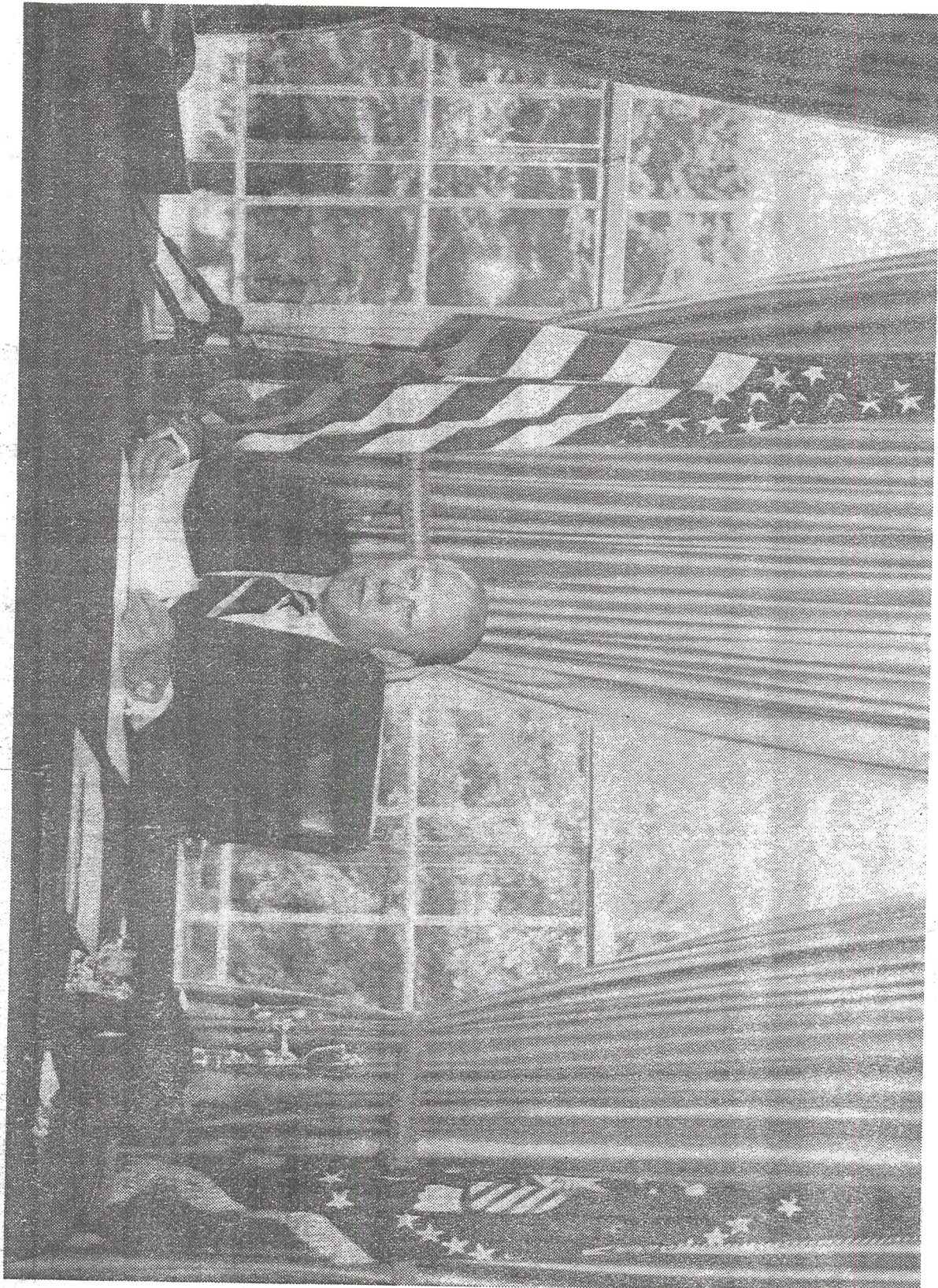
President Ford reads statement that he has granted Richard M. Nixon a "full, free and complete pardon."