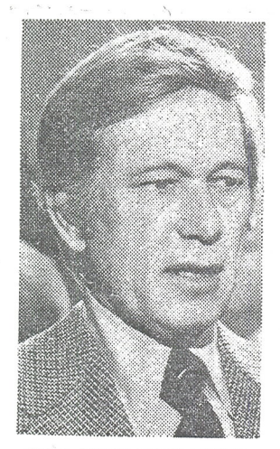
REP. DON EDWARDS ... "I can't understand"

tablished a precedent which will hurt our whole system of the administration of justice for a long time to come."