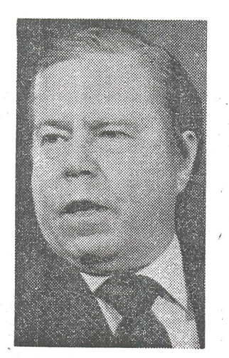
REP. JOHN J. RHODES ... "degrees of reality"

"There is an axiom we all say we believe in: all men-are equal under the law. That includes Presidents and plumbers. What about the 40 or 50 already indicted the 40 or 50 already indicted