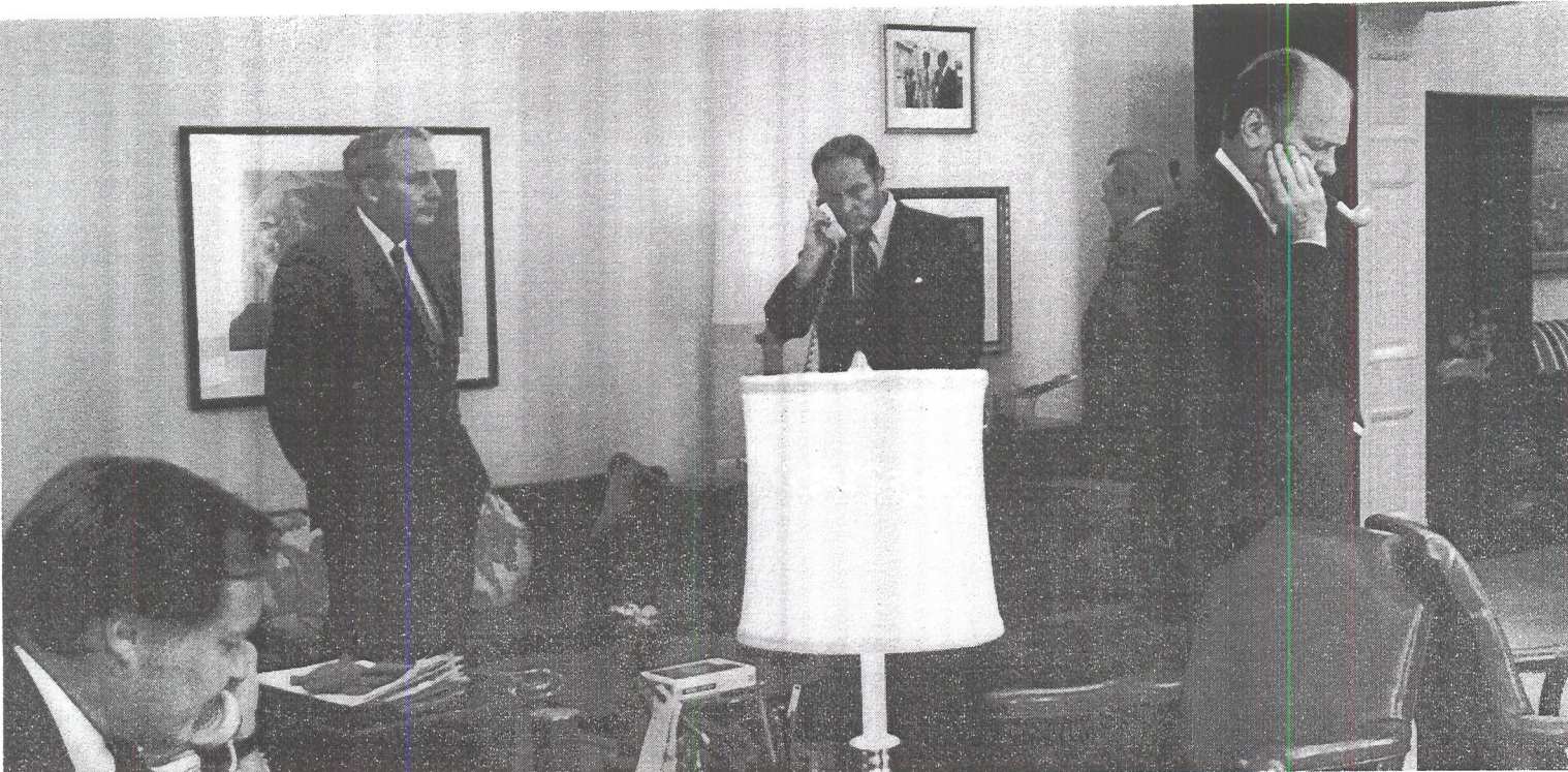
PRESIDENT FORD &amp; AIDES RECEIVING REACTION TO PARDON ANNOUNCEMENT