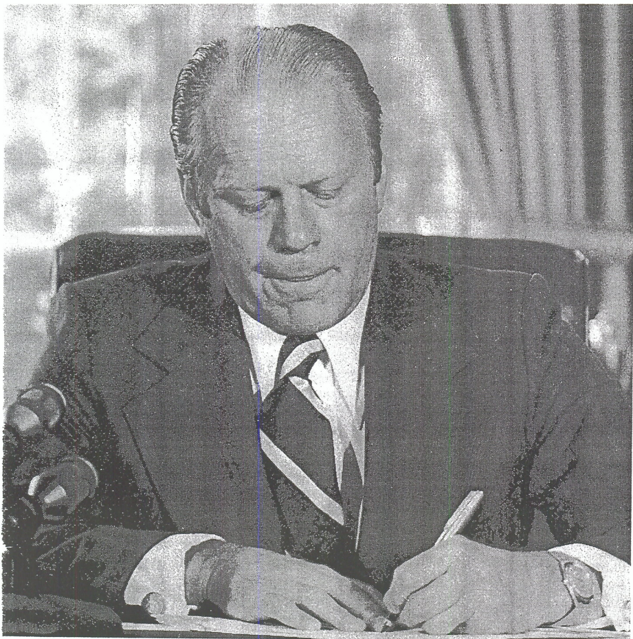
FORD SIGNING PROCLAMATION OF PARDON FOR EX-PRESIDENT NIXON

pardon. At his first press conference on Aug. 28, Ford said that he was not ruling out the possibility of a pardon, but "there have been no charges made, there has been no action by the courts, there has been no action by any jury, and until any legal process has been undertaken, I think it is unwise and untimely for me to make any commitment."