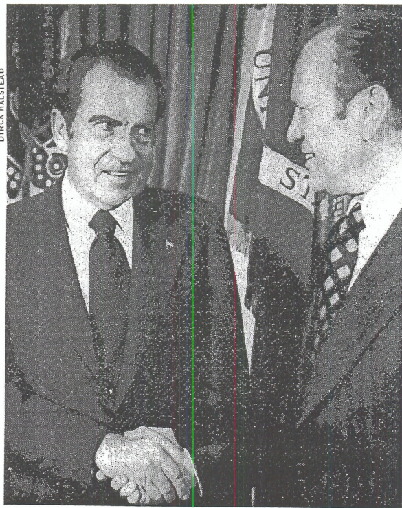
NIXON & FORD IN WHITE HOUSE (1973)