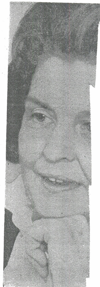
Betty Ford: Not quite

The 8½ months since Ford became Vice President have been "quite a revelation" because she said she found out that "I'm much stronger than I realized" was because more demands have been made on me and it hasn't bothered me a bit."