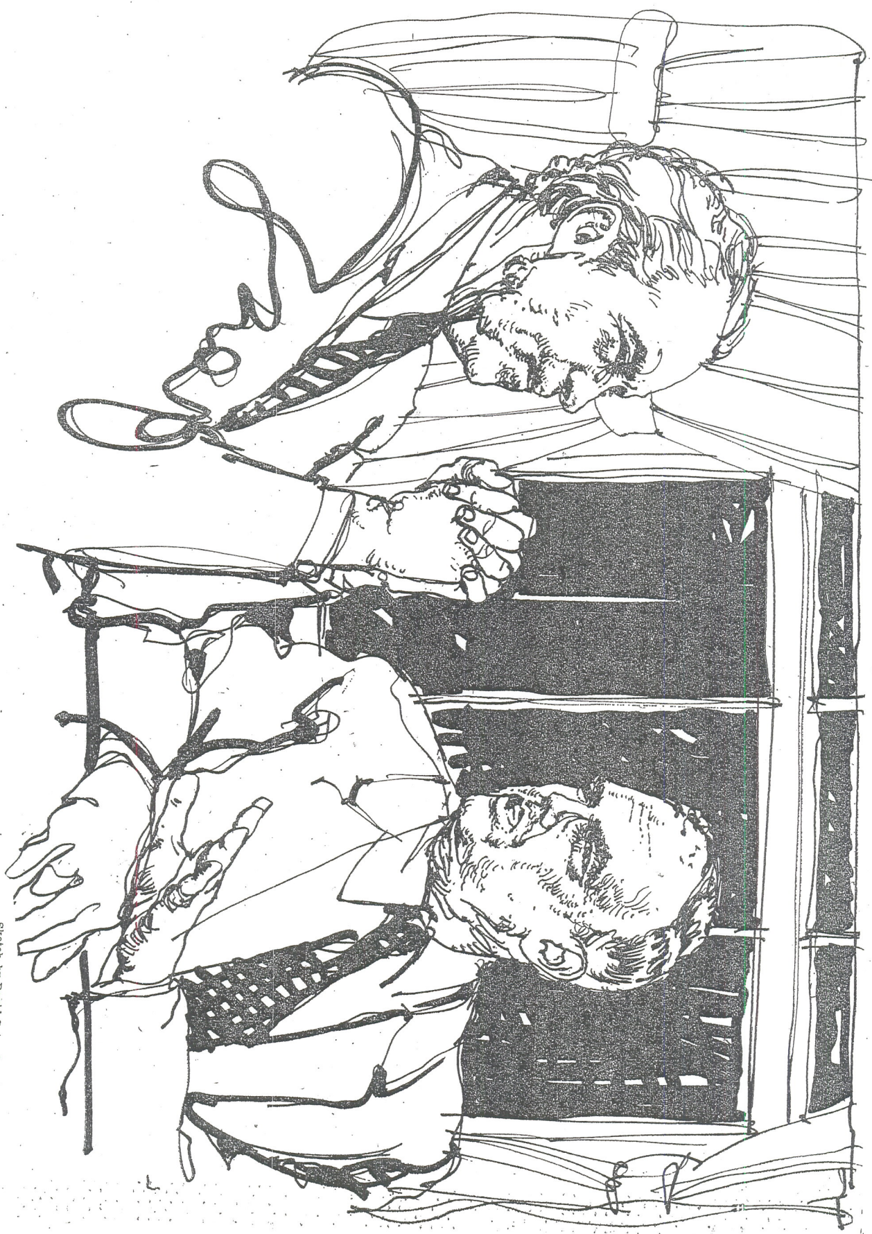
Sketch by David Suter for The Washington Post