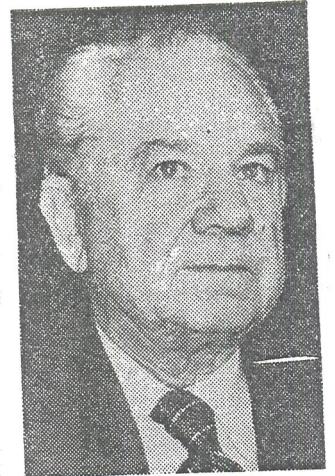
LEON JAWORSKI ... more than suspicion

Jaworski's brief did not mention the Colson plea, but the agreement to drop other charges did not specify that he would no longer be dealt with as a cover-up co-conspirator. The agreement did state that Colson was expected to testify for the prosecution.