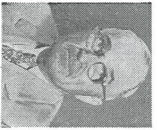
Harry S. Truman

"Well, the point is whatever we say about Harry Truman, etc., while it hurt him, a lot of people admired the old bastard for standing by people . . . who were guilty as hell."