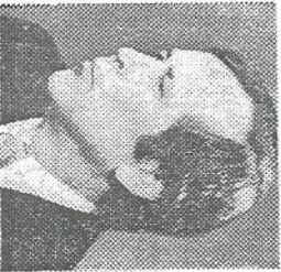
Howard H. Baker Jr.

White House press secretary: "Get out there and act your usual cocky, confident self."