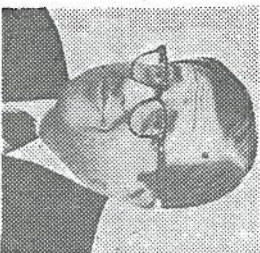
Charles W. Colson

Mr. Nixon's personal lawyer: "A decent fellow. He will make a good witness ... he is smart."