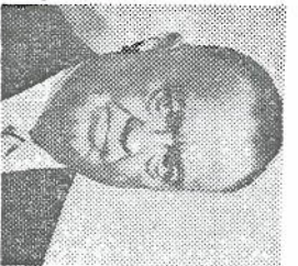
J. Edgar Hoover

"Bobby was a ruthless (characterization omitted)."