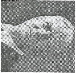
William P. Rogers

"Well, the point is whatever we say about Harry Truman, etc., while it hurt him, a lot of people admired the old bastard for standing by people . . . who were guilty as hell."