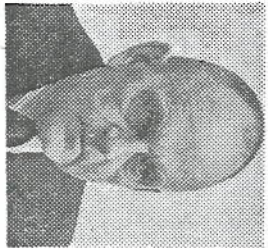
L. Patrick Gray 3d

Tennessee Republican who was vice chairman of the Senate Watergate committee: "A smoothy—impressive."