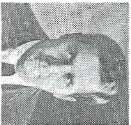
Jeb S. Magruder

F. B. I. Director: "Well, Hoover performed. He would have fought. That was the point. He would have defied a few people he would have scared them to death. He has a file on everybody."