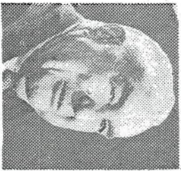
Sam J. Ervin Jr.

President Nixon, in the comparative privacy and informality of his Oval Office discussions with close associates, was given to crisp evaluations of other public figures. Following are some of Mr. Nixon's comments, as culled from the edited transcripts of those conversations.