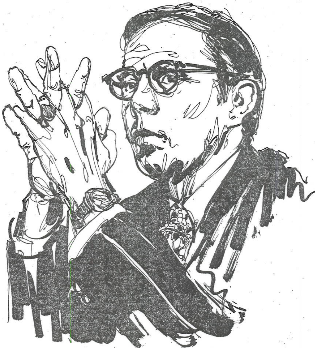
Former White House counsel John W. Dean III.