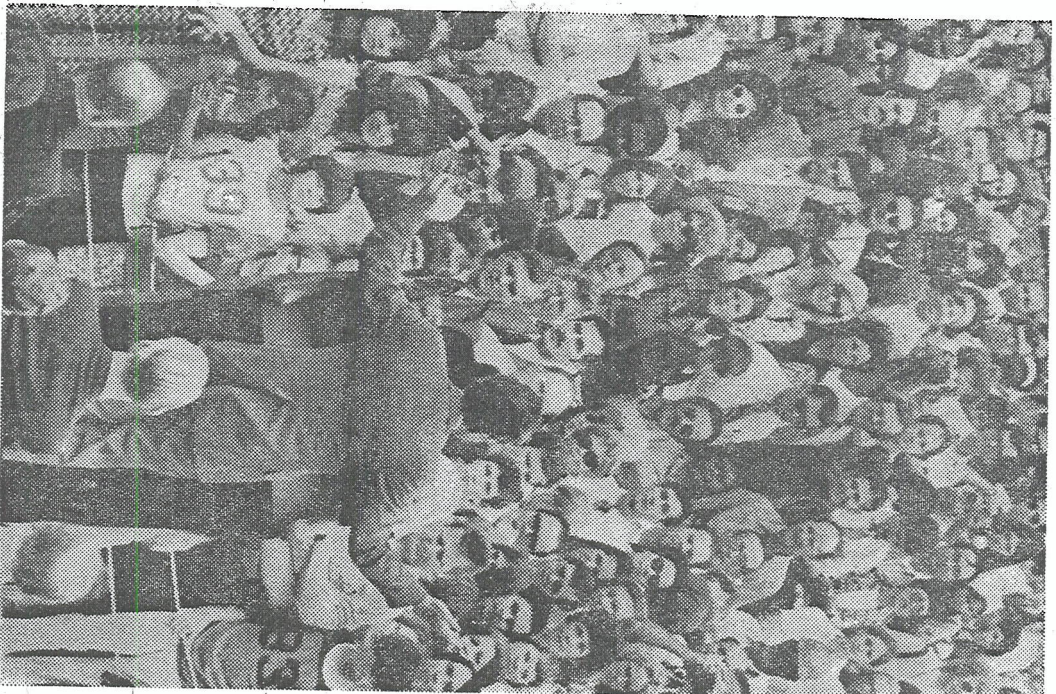
President Nixon chats with a waitress during a stop at a Houston drugstore for coffee. Later he spoke at the Lyndon Baines Johnson Space Center, near Houston.