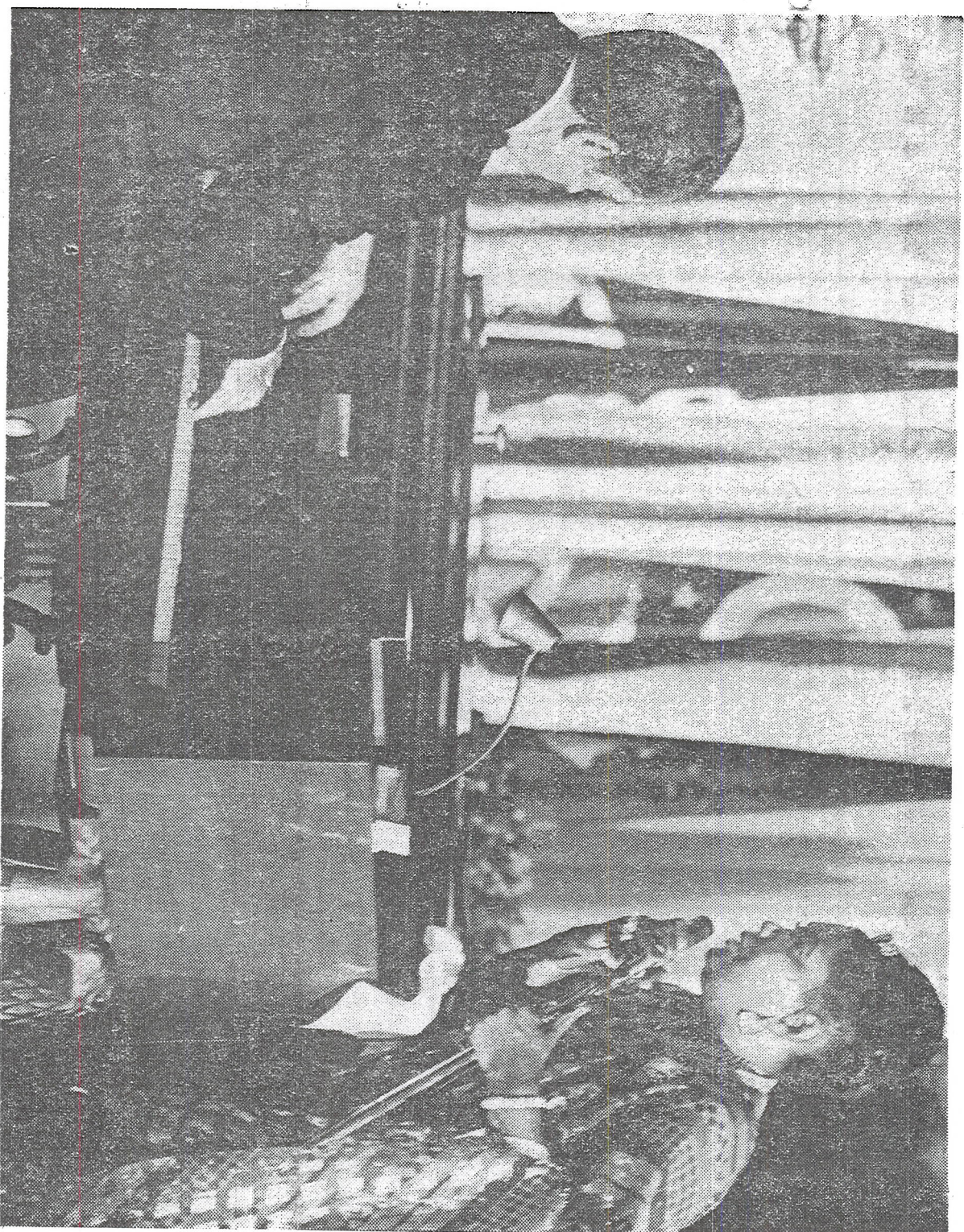
Pearl Bailey: "Anything you play, I know—however old." President Nixon: "That's the surest bet I ever heard."