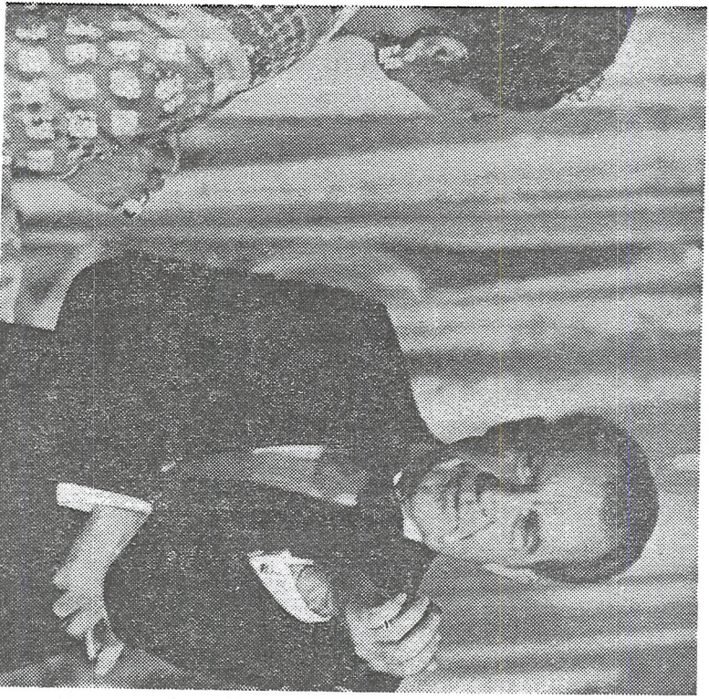
"You don't play as well as I sing but I don't sing as well as you govern," Pearl Bailey told President Nixon Thursday night as he sat down to play the piano and she began to sing.