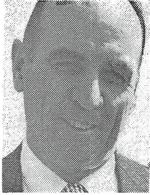
James W. McCord Jr. is back on his old job.