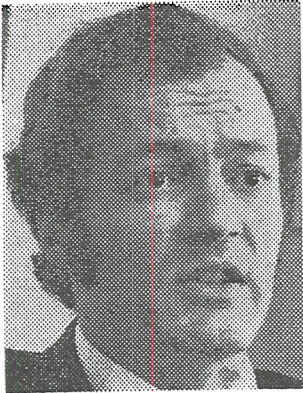
Egil Krogh Jr. is serving a prison term for his role in the Ellsberg burglary.

worked on his controversial income tax returns, said on the day he pleaded guilty that he was still Mr. Nixon's lawyer in some matters. However, the President's press secretary, Ronald L. Ziegler, said last May that Mr. Kalmbach was no longer working for the President.