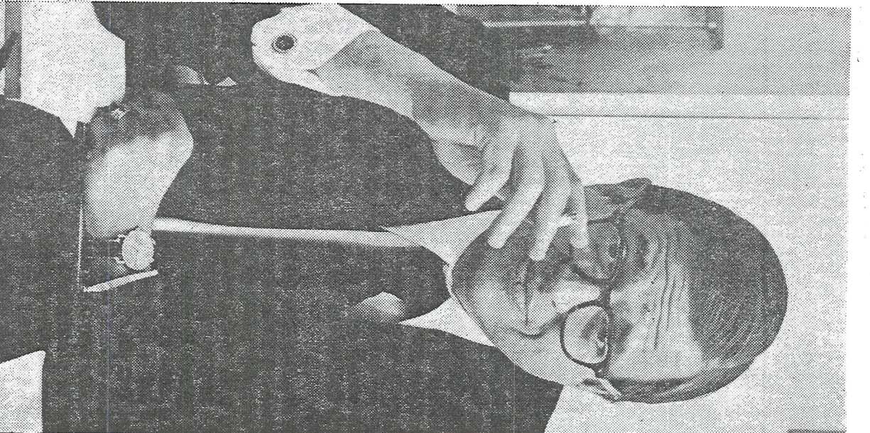
Charles Colson, former special counsel to the President, puts on his jacket to face photographers, after being indicted for conspiracy and obstruction of justice.