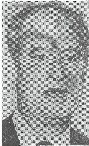
ROBERT A. MAHEU

Hughes was then still ensconced atop the Desert Inn Hotel, which he owned. Hughes had started buying