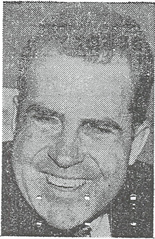
... vice president, 1956