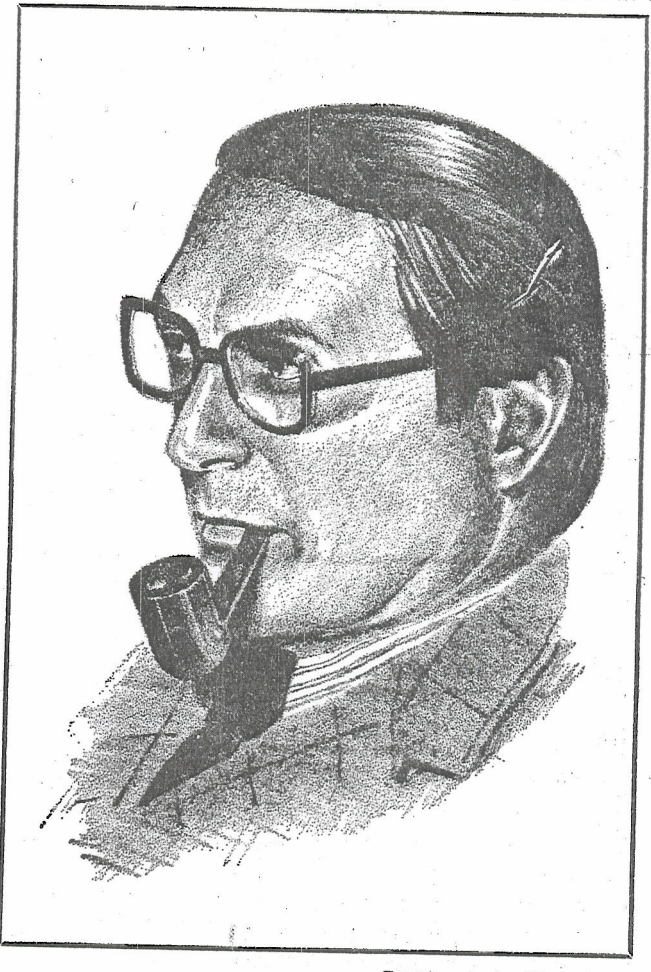
Drawings by Lucille Carter