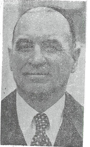
JAMES W. McCORD

about Watergate has come out, and added he participated in the breaking "because