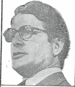
Elliot L. Richardson May, 1973—Oct., 1973