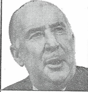
John N. Mitchell Jan., 1969—Mar., 1972