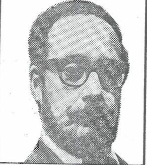
Robert H. Bork (Acting) Oct., 1973—