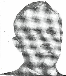
Richard G. Kleindienst Mar., 1972—May, 1973