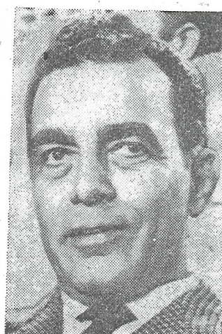
C. G. (BEBE) REBOZO