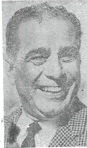
C. G. (BEBE) REBOZO ... feared embarrassment