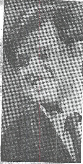
TED KENNEDY "The last living heir"