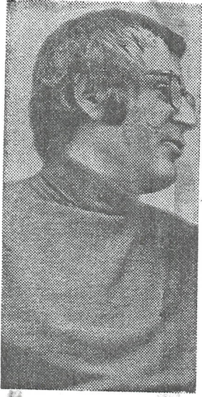
DAVID HALBERSTAM JFK's mistake