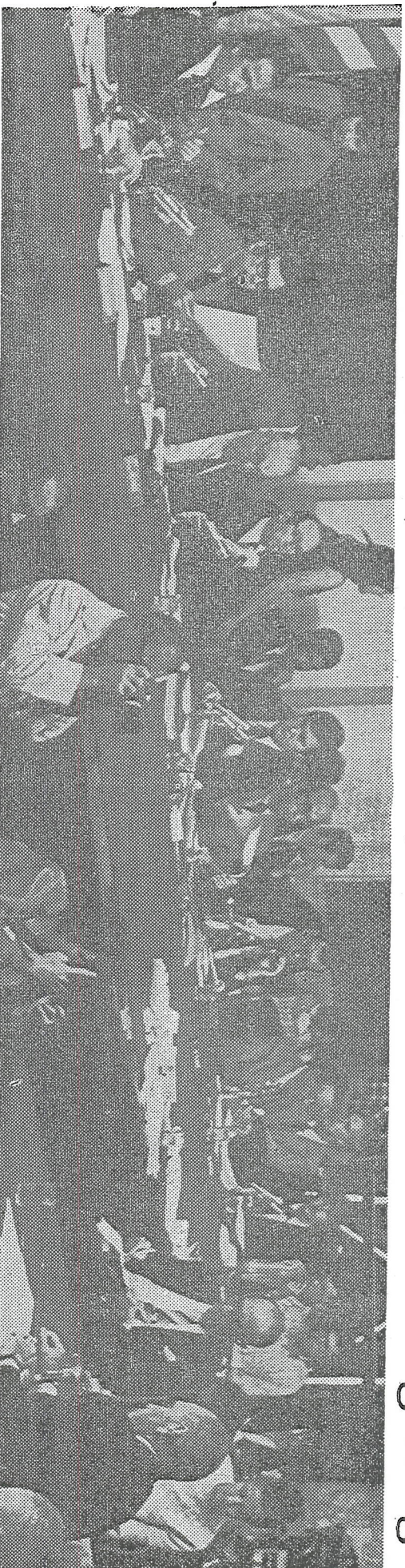
L. Patrick Gray 3d, former acting head of the F.B.I., sits at right facing the committee table at the Senate Watergate hearing

Q. All right, now, would you relate to the committee what Mr. Haldeman said and what you or Mr. Helms said? A. Mr. Haldeman said that the bugging of the Watergate was creating a lot of noise, that the opposition was attempting to maximize this, that the F.B.I. was investigating this and the leads might uncover some C.I.A. tant, people, and he then asked Mr. Helms what the agency connection was. Mr. Helms replied quite emphatically that there was no agency connection and Mr. Haldeman said that nevertheless, the pursuit of the F.B.I. investigation in Mexico might lead to some important activities or assets.