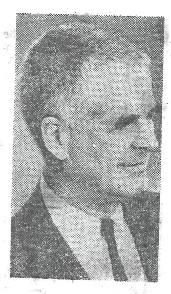
ARCHIBALD COX Special prosecutor