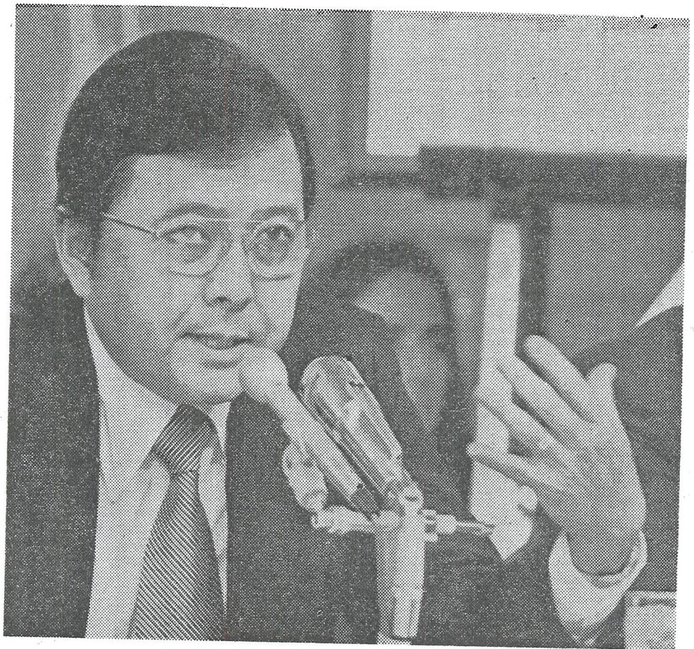
Daniel K. Inouye, Democrat of Hawaii, questioning John D. Ehrlichman yesterday

A. Now, it seems to me that it would have been folly for me at some later time, then, to suggest that the briefcase be thrown into the flood tide of the Potomac.