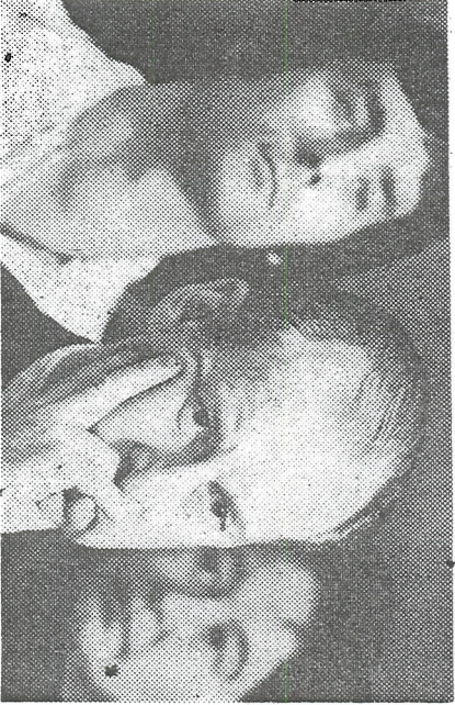
Men in the audience at the Watergate hearing yesterday