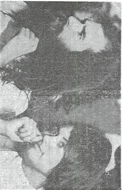
A man and woman among those who gained admission