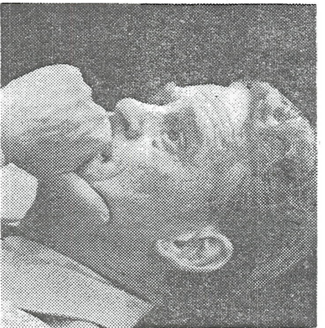
Senator Edward J. Gurney, Republican