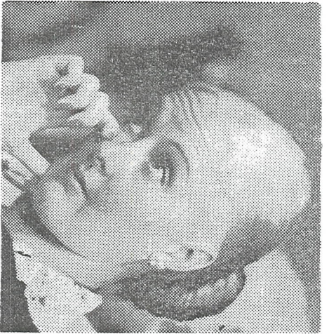
John W. Dean 3d's wife, Maureen