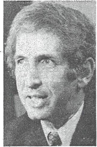
DANIEL ELLSBERG ... freed of break-in

"because of my experience in this case."