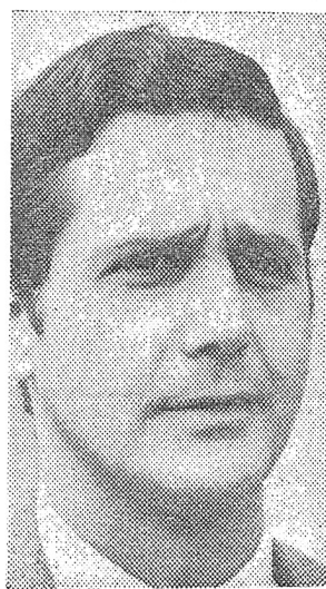
Jeb Stuart Magruder