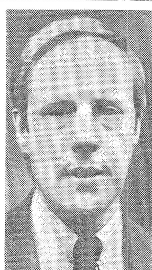
John W. Dean 3d