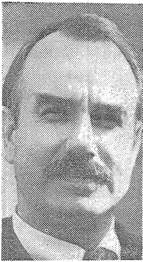
G. Gordon Liddy