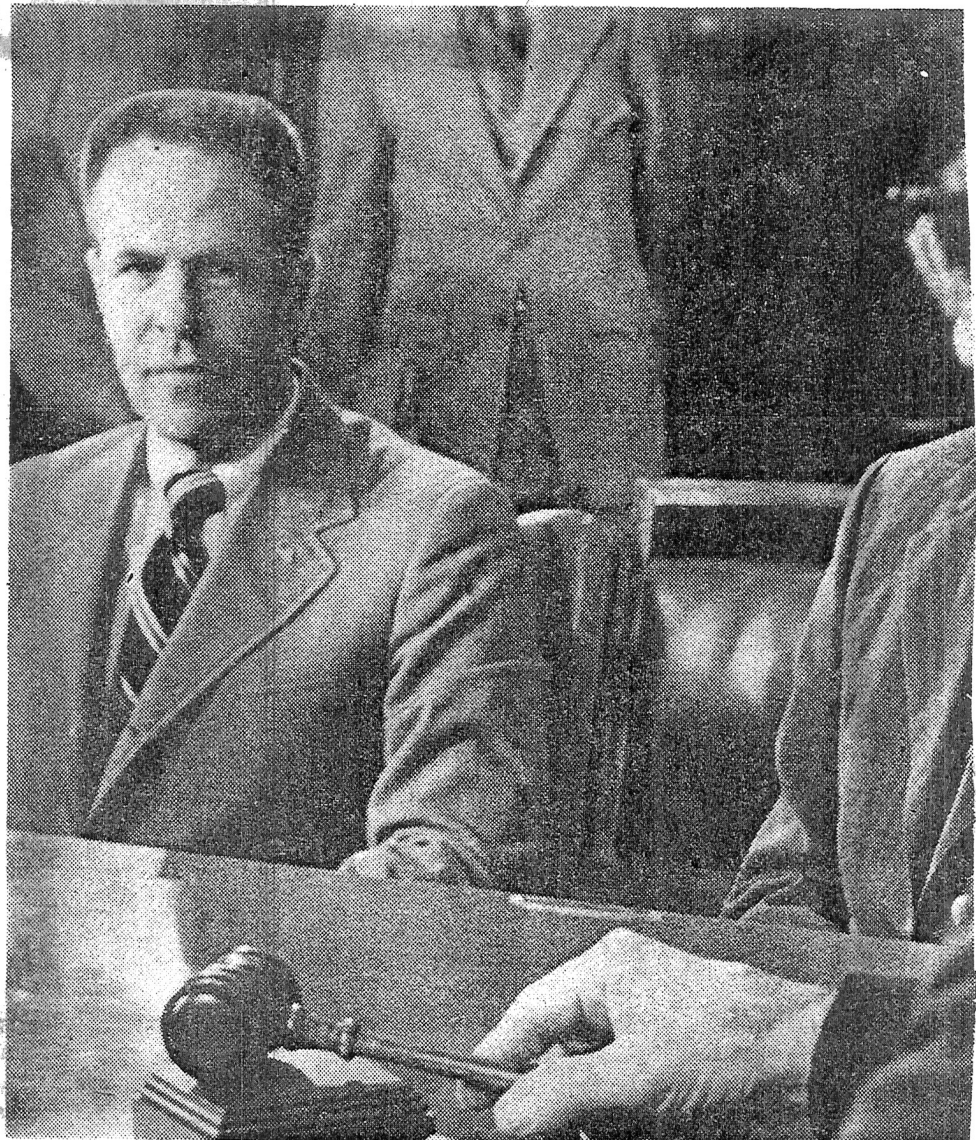
H. R. (Bob) Haldeman faces Chairman John McClellan before the Senate Appropriat

after appearing before the Senate Appropriations Subcommittee yesterday.