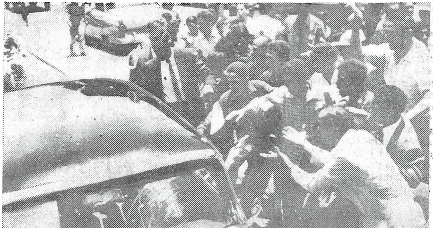
Two of President Nixon's "Six Crises": The Kitchen Debate with Soviet Premier Khrushchev in Moscow in 1959; Rioters attacking Mr. Nixon's car during his visit to Caracas, Venezuela, in 1958.