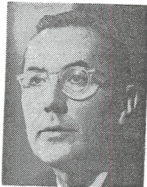
William E. Colby