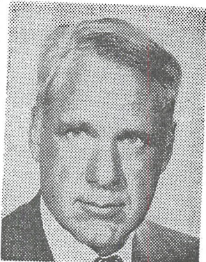
James R. Schlesinger