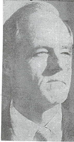
broken into on Sept. 3, 1971, by Liddy and Hunt.

In last Friday's interview, the F.B.I. said, Mr. Ehrlichman stated that he "was not told that these two individuals had broken into the premises until after this incident had taken place.