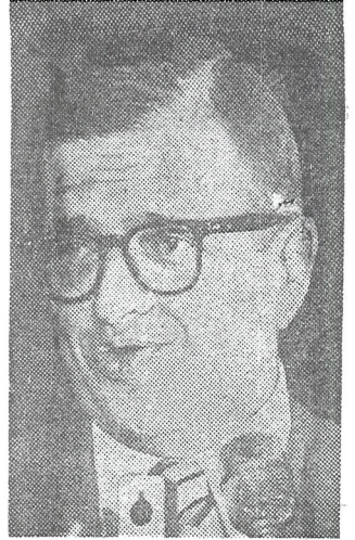
CHARLES W. COLSON ... warned President

Associates of Dean said that Dean is ready to implicate other persons in the case.