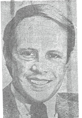
JOHN W. DEAN III ... removed from case