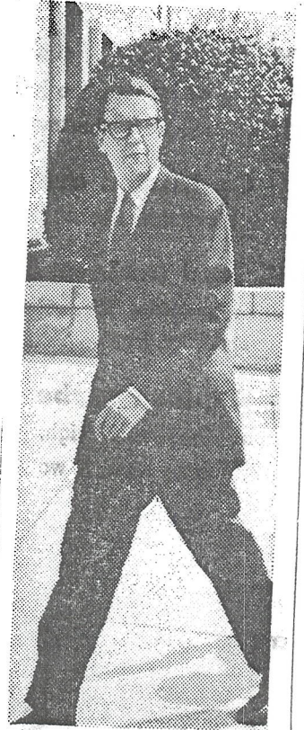
Former Attorney General John N. Mitchell replying to reporters' questions during the short walk to his car yesterday after he appeared before grand jury in Washington.