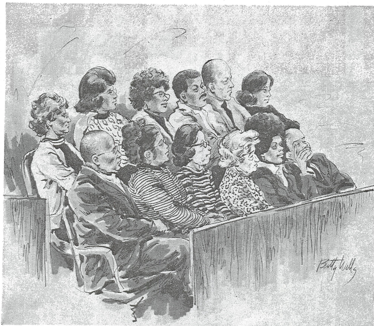
Sketch by Betty Wells

The 12 jurors in the Watergate trial listen intently during yesterday's session. They heard 60 witnesses in 16 days.