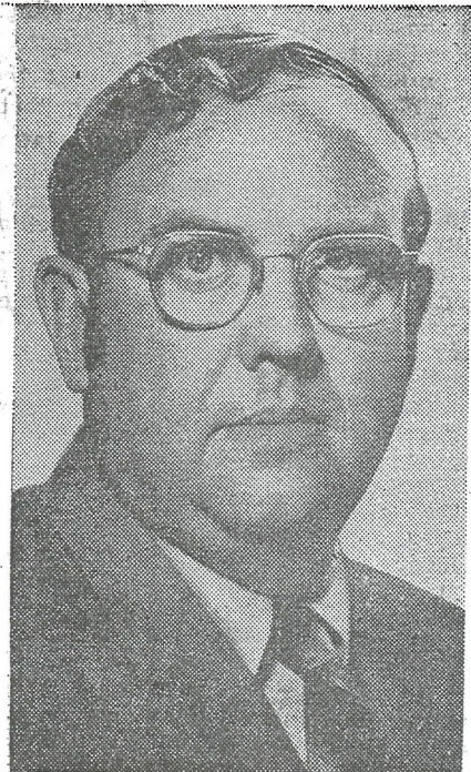
The Washington Post