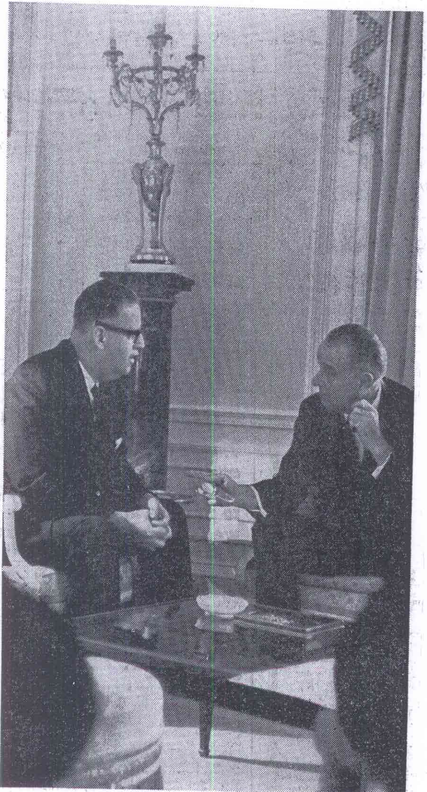
On May 26, Abba Eban, Israeli Foreign Minister, warned of trouble

On May 18 U.N. forces withdrew. Egyptian troops entered the Sinai Peninsula and took up positions on Israel's borders. Despite his ill-conceived first maneuver, U Thant then announced that he was going to Cairo to try to pre-