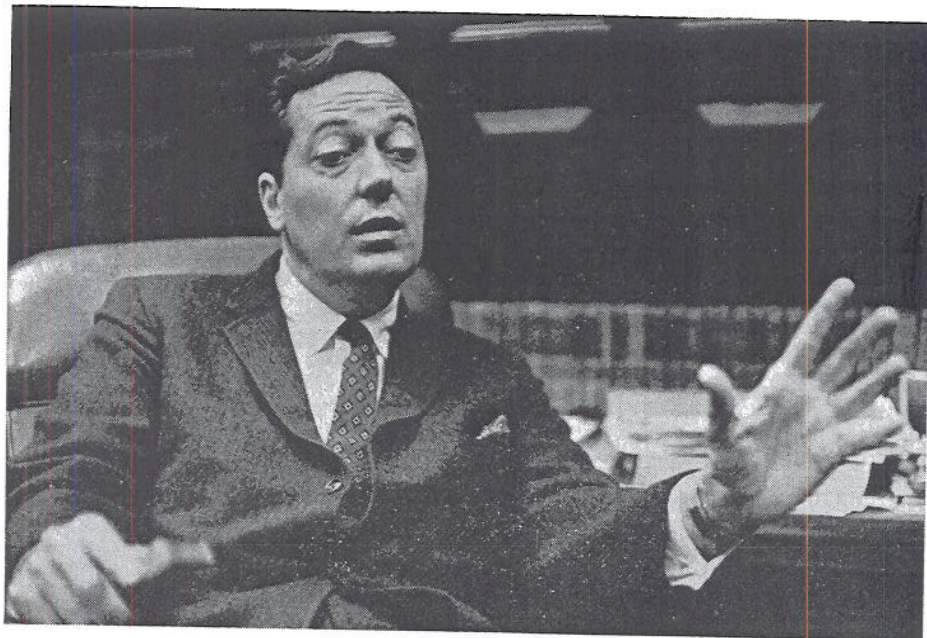
District Attorney Garrison: Who were the real plotters in New Orleans?