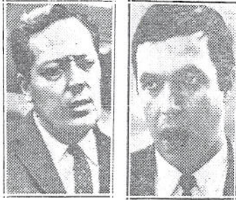
Jim Garrison Prosecutor and chief witness