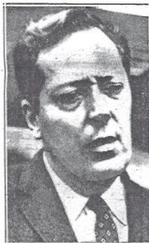
District Attorney Garrison Brings forth his witness

It was a triumphant moment for Garrison, who had been confronted by jeers and skepticism