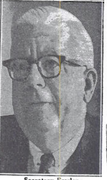
Secretary Fowler Presents tax proposals

Although some leading economic indicators have been slipping, Fowler maintained that the Administration wanted Congress to act now because the very special-