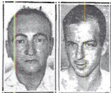
The late David Ferrie The late Lee Oswald Placed at the meeting