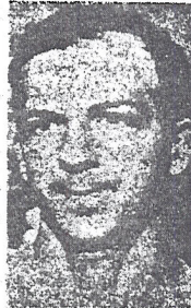
Lee Harvey Oswald