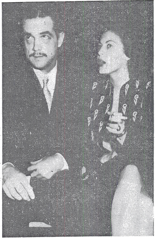
Howard Hughes with Ava Gardner in 1946

The body was in the pathology laboratory in the basement ogy laboratory in the basement of the hospital early tonight. Two city policemen stood in front of the door. Some hospital personnel said they heard that the body was to be removed from the hospital moved from the hospital.