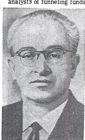
YURI ANDROPOV · ... Soviet spy chiefs: old look, new look

Russians - and other nationalists had been common under Stalin, the practice was curtailed after the dictator's