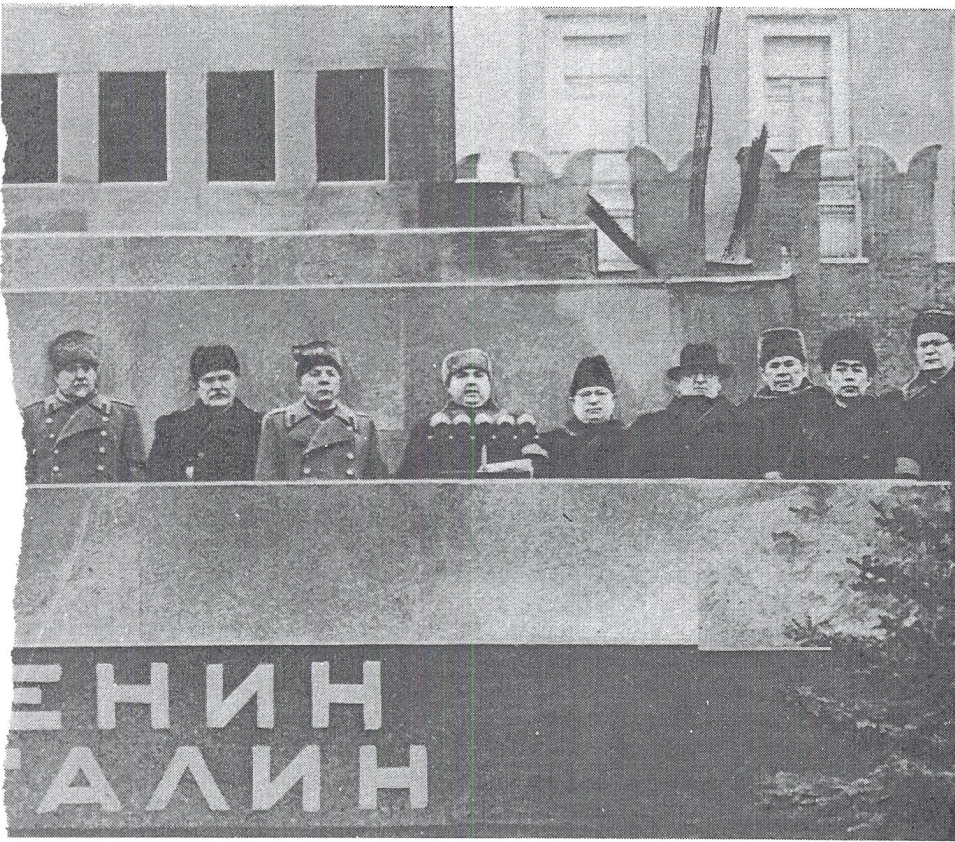
in the Fifties—CIA men began to look and act like their Russian counterparts.

ful, patriotic men of CIA began to look and act more and more like their counterparts—the ogres of KGB.