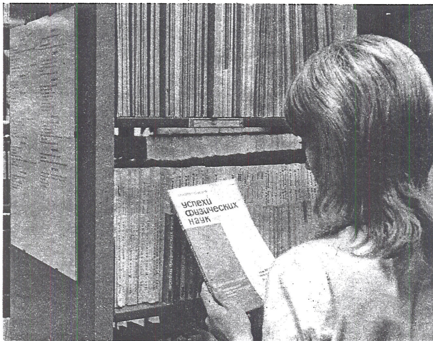
A staff member selects a Russian book for study. The head of the Soviet Internal Affairs branch is a woman, who requested Parade's reporter not reveal her name.

agency's budget office. She helps prepare the agency's requests for money from Congress and monitors the CIA's immense expenditures. A math major from the University of Texas, she was hired in 1963, then got a master's degree in economics. She has worked in the agency's Office of Economic Research, the now-defunct Office of National Estimates and attended the National War College. Her present job pays close to $35,000 a year.