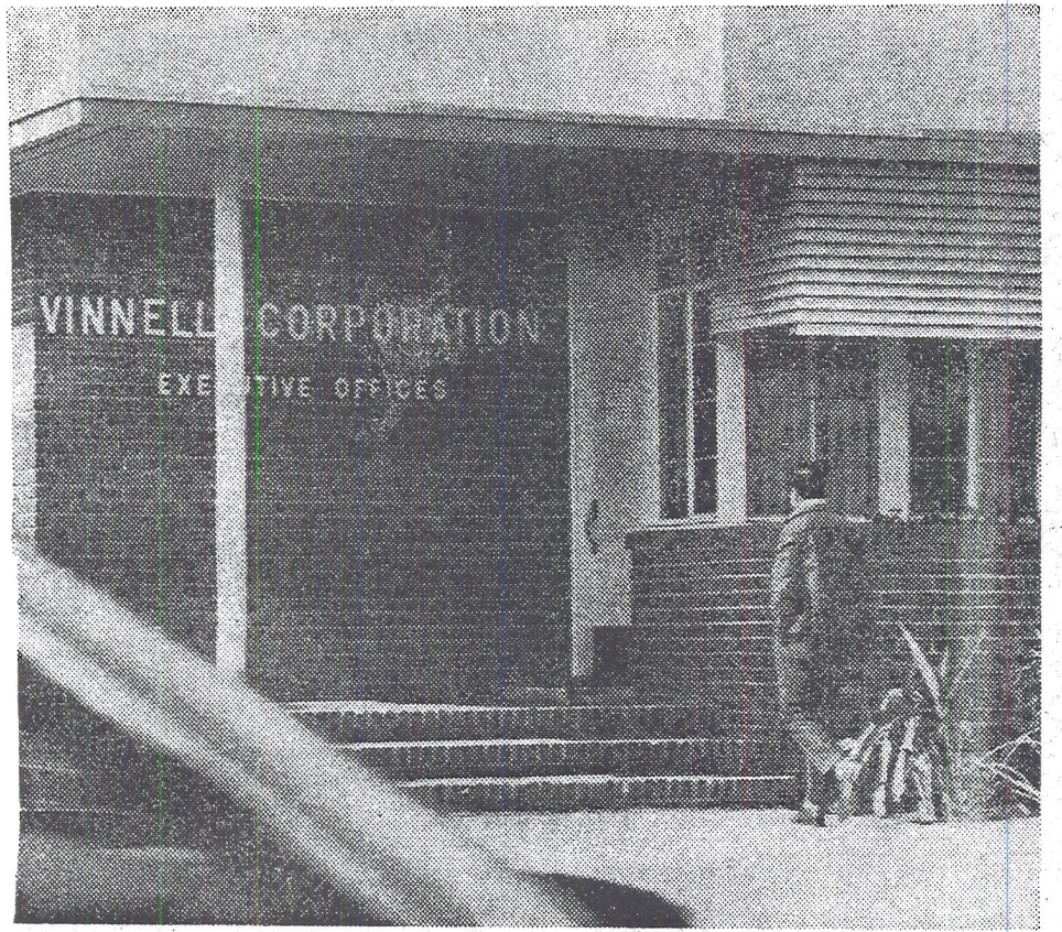
The headquarters of the Vinnell Corporation last week in Alhambra, Calif.